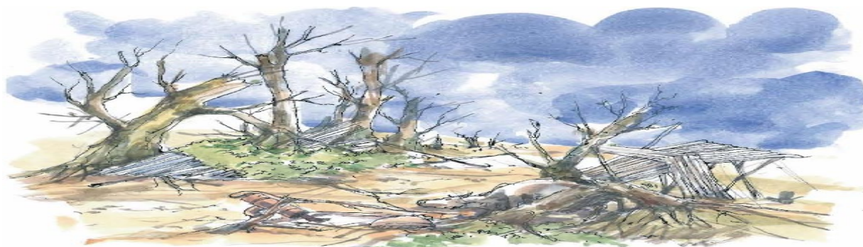
Village damaged by Sidar & Aila