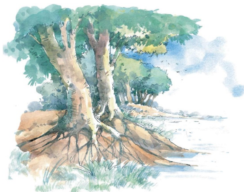
Prevention of Erosion of Soil by roots of trees

Hamper/damages caused by natural disaster: We have come to know about the natural disaster brought about by Aila & Sidar. Almost one fourth of the forests in the Sundarbans have been lost. Natural disaster causes much damage to a country or region.